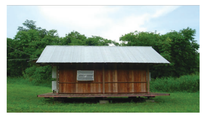
FIG. 2. Experimental hut constructed specifically to evaluate vector bionomics.

Experimental hut studies. Experimental hut studies are common tests used to validate laboratory findings of vector behavioral responses to insecticides (time and density of house entry or exit), perform small-scale field trials of interventions (IRS, LLINs), and describe natural ecology patterns of disease vectors (e.g., host choice; indoor vs. outdoor biting; resting preferences) both before and after treatment (World Health Organizaton 2006, 2009a, 2009b, 2013b, 2013c). There are two common types of experimental hutnewly constructed to serve specific study objective(s) (Fig. 2), and local housing that has already existed in the study area. In such studies, it is necessary to attract host-seeking vectors to the hut and collect them to assess the outcome of interest (e.g., a reduction in vector density in a treated hut compared to a control without intervention). Currently, there are no equally effective or near-equivalent substitutes for