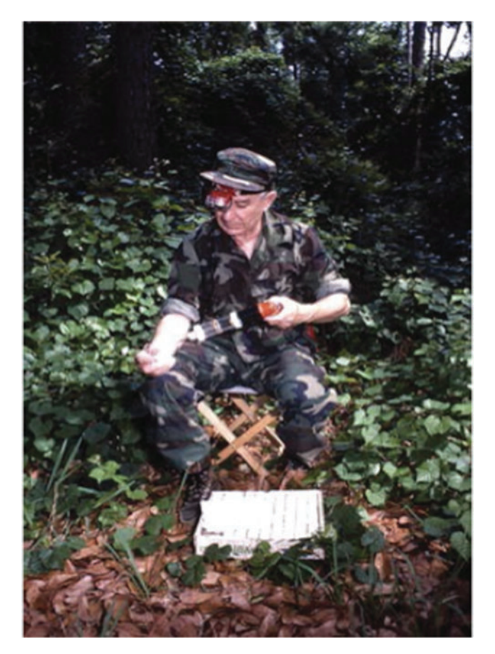
FIG. 4. Human-landing catch (HLC) technique in an outdoor setting. Mosquitoes landing on the exposed extremity (arm or leg) are collected using a battery-operated or mouth aspirator.

estimate flight distances, evaluate the efficacy of transmission control tools, such as topical repellents, bed nets, and chemical insecticides, as well as to describe vector species compositions in a particular study site. In field studies, the vectors can be further analyzed for infection rates to estimate pathogen inoculation (transmission) rates, identify and incriminate primary, secondary, and incidental vector species, determine pathogen species composition, and compare before and after intervention landing rates to monitor effectiveness of a control strategy. HLCs are employed under laboratory, semi-field, and field conditions based on research goals and therefore can vary in the risk of potential adverse effects to humans. HLCs have been most widely used for monitoring the human-biting mosquito population that is epidemiologically relevant to transmission and control of malaria, arguably the arthropodborne disease with greatest global health burden (World Health Organization 2013a). Because HLCs provide a sensitive measurement of mosquito population presence and density, this method is expected to continue to be a vital tool in the coming years as national vector control programs shift their malaria agenda from control to elimination, which, depending on the design of the program, may suppress mosquito populations and make them more difficult to measure.